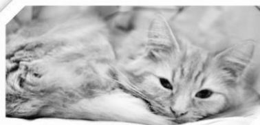
Shirlaine Forrest, 2017