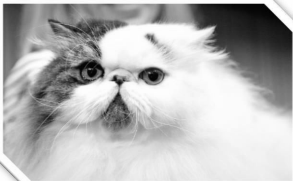
Shirlaine Forrest, 2017